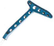
Shoulder Stock #7204780