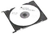
TruViewer Software CD #3204700