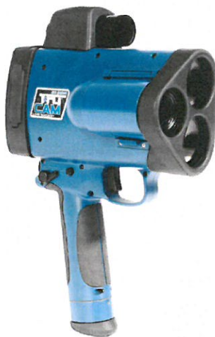
TruCAM Video Laser