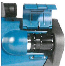
Access to Camera Lens