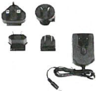
Charging Plugs (4) #3004936 Battery Pack Charger # 3004971