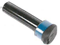
TruCAM Battery Pack Assembly #7024922