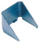
Sun Shade #1434173