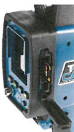
SD Card Slot