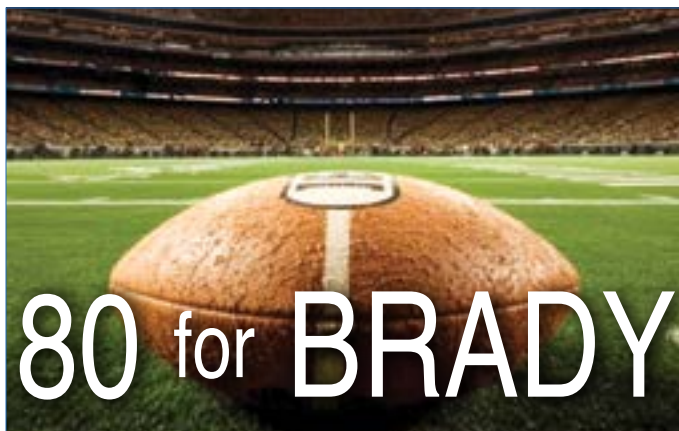
80 for Brady

Relive the iconic 1986 original Top Gun through the can-do spirit personified by Cruise himself and enjoy two hours of pure wow.