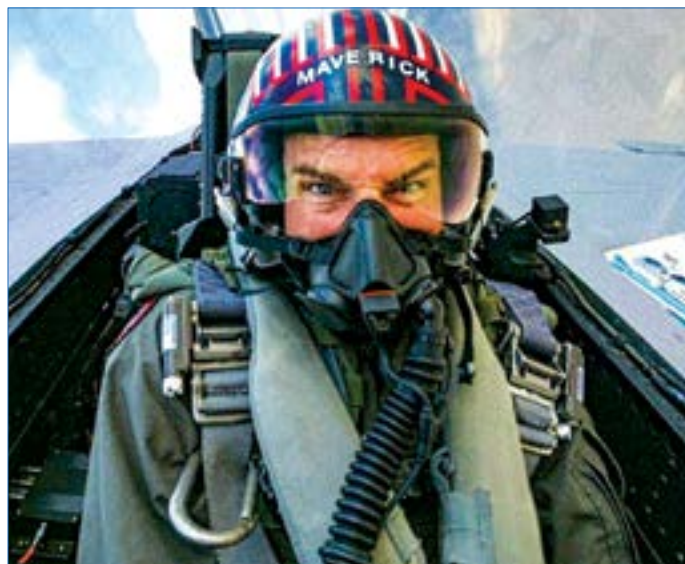
Top Gun Maverick

Movies begin at 8:30 p.m. until August when times will be adjusted according to sunset.